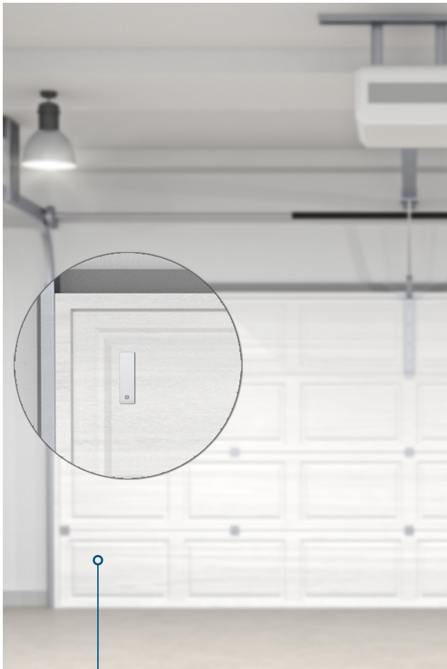
Application example: Garage door

Operation requires connection to one of the following solutions: