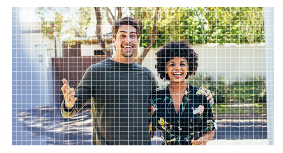
H.264 (Mainstream Video Compression)

*When the 24/7 recording mode is applied, the H.265 technology can reduce the video storage space and bandwidth by 50% as compared to H.264.