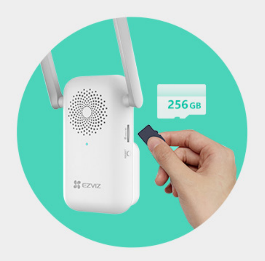
Supports MicroSD Cards

You can insert a microSD card onto the indoor chime to save your recordings locally, without worrying about any data loss even if the doorbell is damaged or lost. You can also subscribe to EZVIZ CloudPlay for unlimited storage space and an additional layer of data protection.