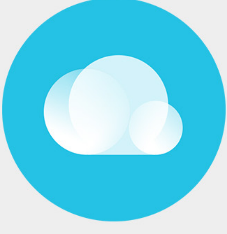
Encrypted Cloud Storage*