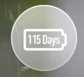
Up to 115-Day Battery Life* (5,200 mAh rechargeable battery)