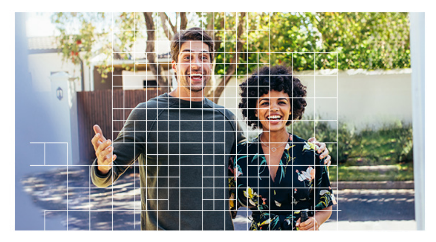
H.265 (Upgraded Video Compression)